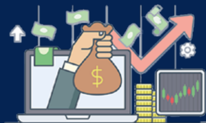
Increase in Revenue